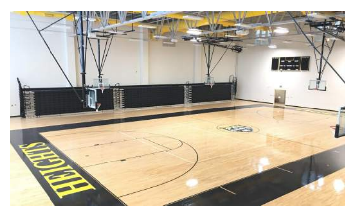
Area B Competition Gym Bleacher Installation