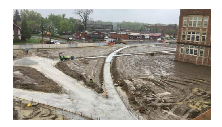
Area G Courtyard Sidewalk Placement