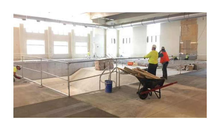
Area C Natatorium Concrete Pool Deck Placement