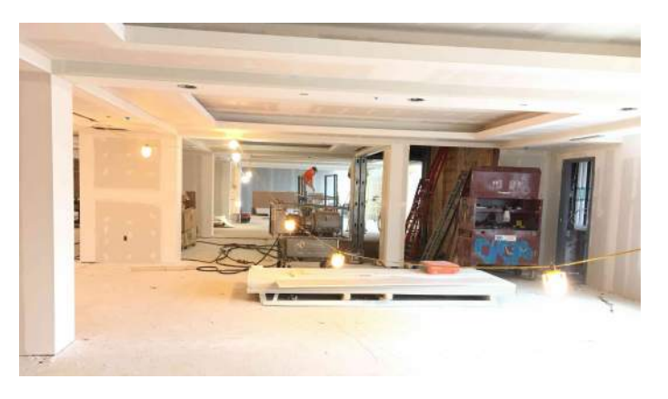
Area G Cedar Level Coffered Ceiling Finishing