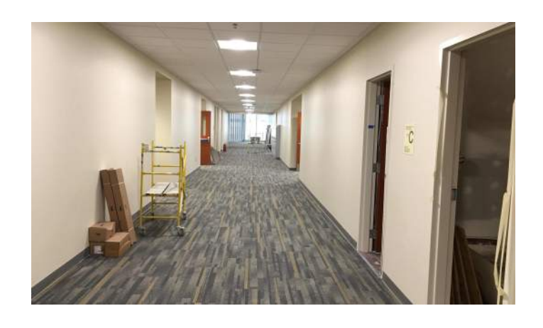
Area A 3rd Floor Finishes