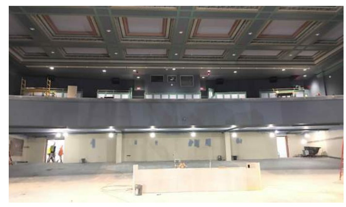
Area G Auditorium Painting